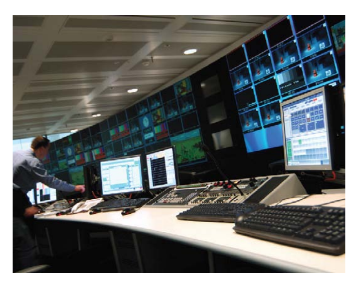
Commander digital matrix intercom installed at BBC London

Orator is a very cost effective system in a 2RU frame. Supplied as standard with 18 \times 18 ports, an additional field upgrade adds a second card with 18 \times 18 capacity to provide a 36 \times 36 matrix. A second hot swappable, redundant power supply may also be fitted.