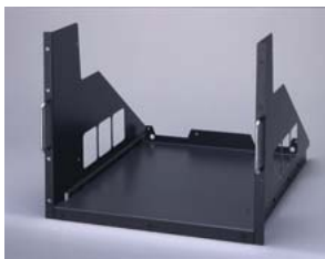
RK-C1900E ■ EIA Rack Mount Adapter